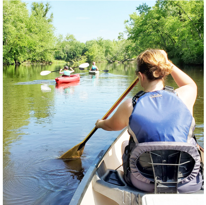
Kayakers enjoying our peaceful local waters