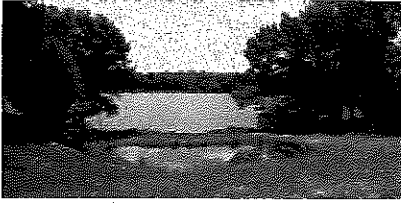
Martin Lake shores Beach