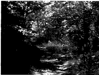
North Star Park Trail