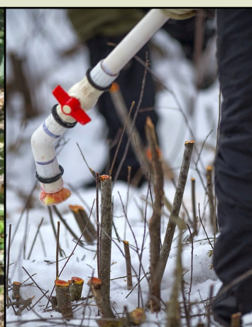
Use a 'kill stick' for basal bark or stump treatment.