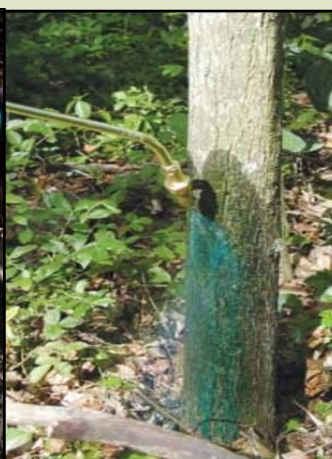
Basal bark spray around the entire trunk of the tree.