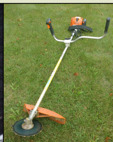
Brush saw can be used to cut small diameter buckthorn.